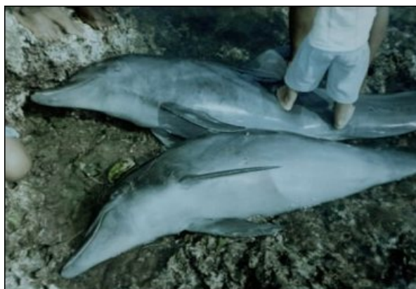
Two dead dolphins at a village near Honiara caught by one of the local Solomon Islander men now working for the Dolphin Export Syndicate

Villagers in the Solomon Islands have complained that large areas of coral reef are being destroyed by dynamite fishing to feed dolphins caught for export to overseas entertainment venues.